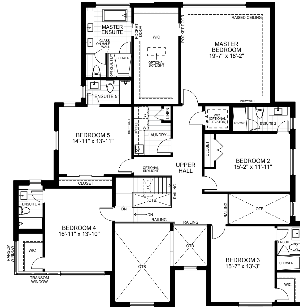
SECOND FLOOR ELEVATION A